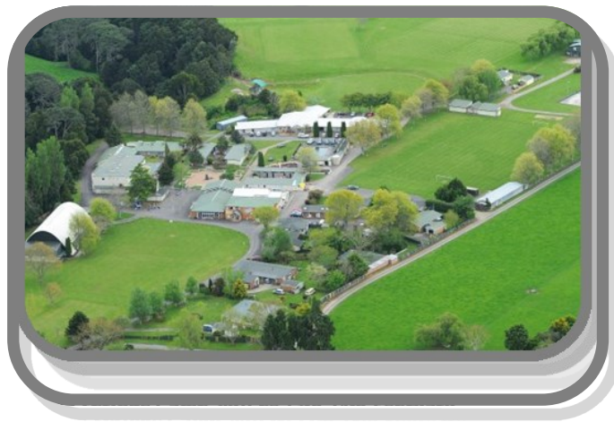
Totara Springs Camp will be 10th—12th February

Swimming will be starting immediately and will carry on as long as the weather permits. If your child will not be swimming please send a note to school with them. We will be using reading logs to monitor and